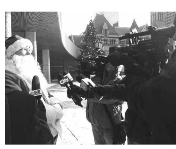
On the eve of the first full Council meeting, Santa Claus made a special delivery of almost 2,000 letters to Toronto City Councillors from Torontonians asking newly elected councillors to keep the environmental promises they made during their campaigns.

Through its "Help Us Keep Council Green" letter writing campaign, TEA collects over 2,000 letters asking newly elected councillors to honour their commitment to building a green Toronto.