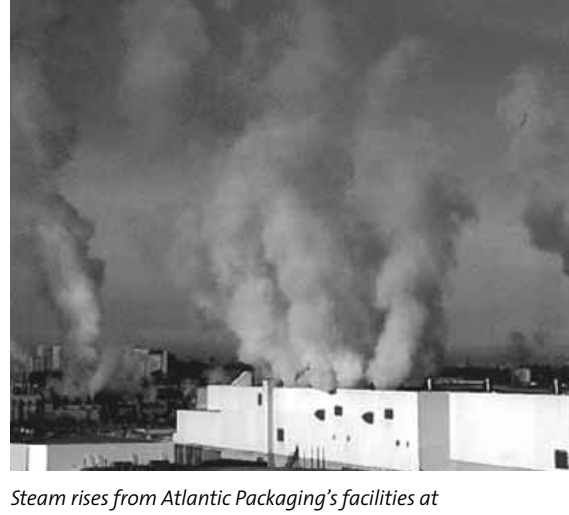
111 and 333 Progress Avenue.

Leading up to the release of the data, TEA will be increasing community awareness and preparedness to tackle toxic industrial pollution in our neighbourhoods. We'll also be working with a coalition of health and environmental groups to profile green industries in Toronto, in order to encourage other businesses to voluntarily reduce chemical use and prevent pollution.